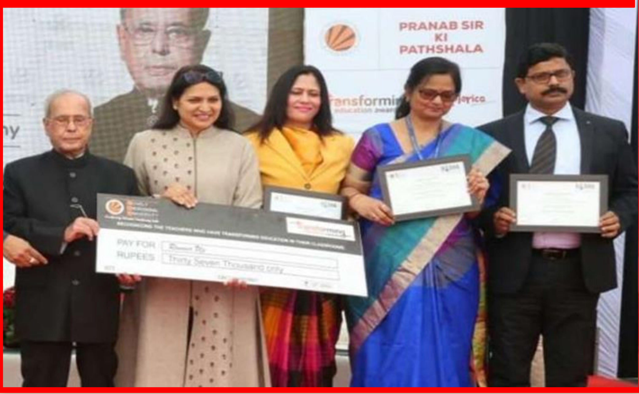
"The great aim of education is not knowledge but action."