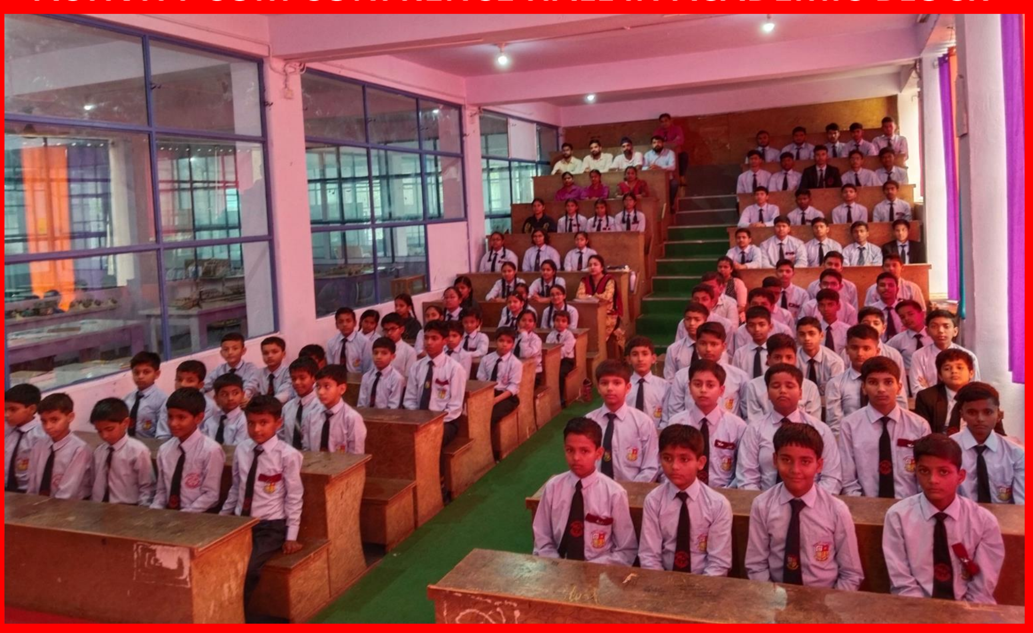
"Sky is the limit."