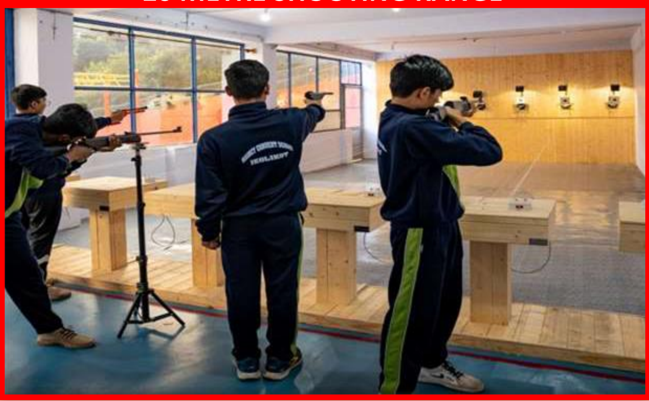
"Start where you are use what you have. Do what you can."