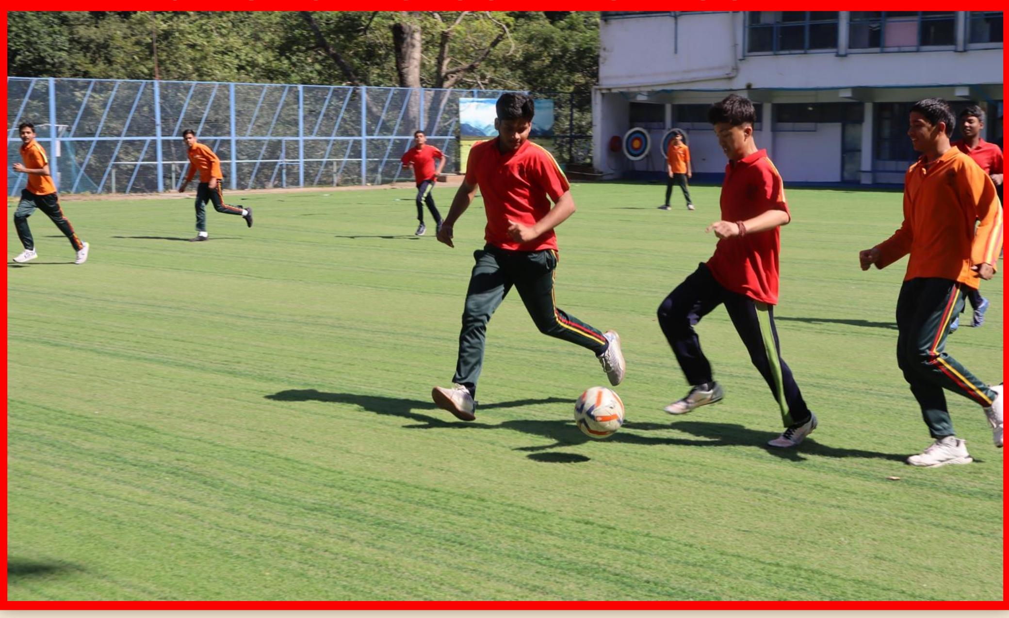
"The best way to predict your future is to create it."