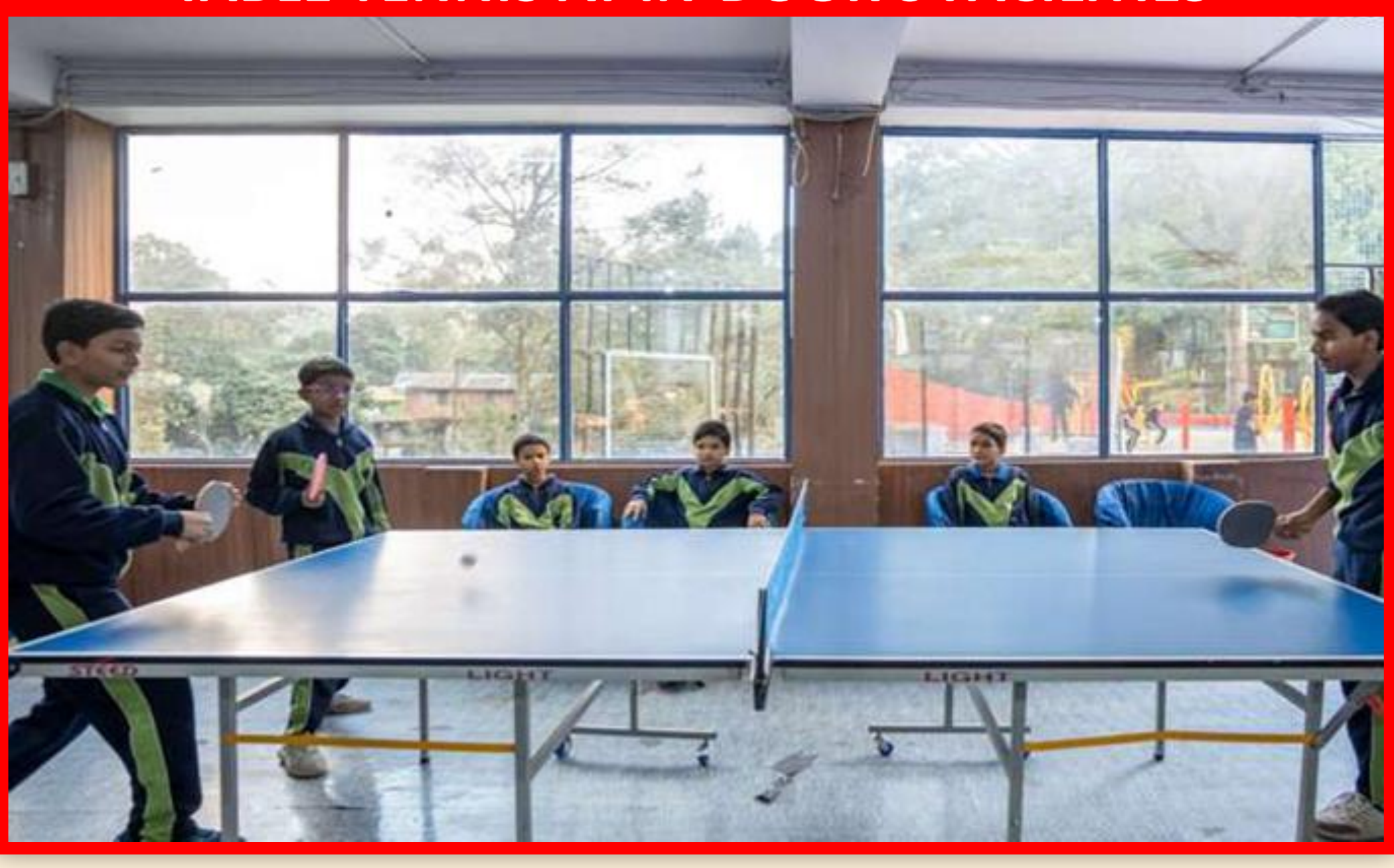
TABLE TENNIS AT IN-DOOR'S FACILITIES

"Success usually comes to those who are too busy for it looking."