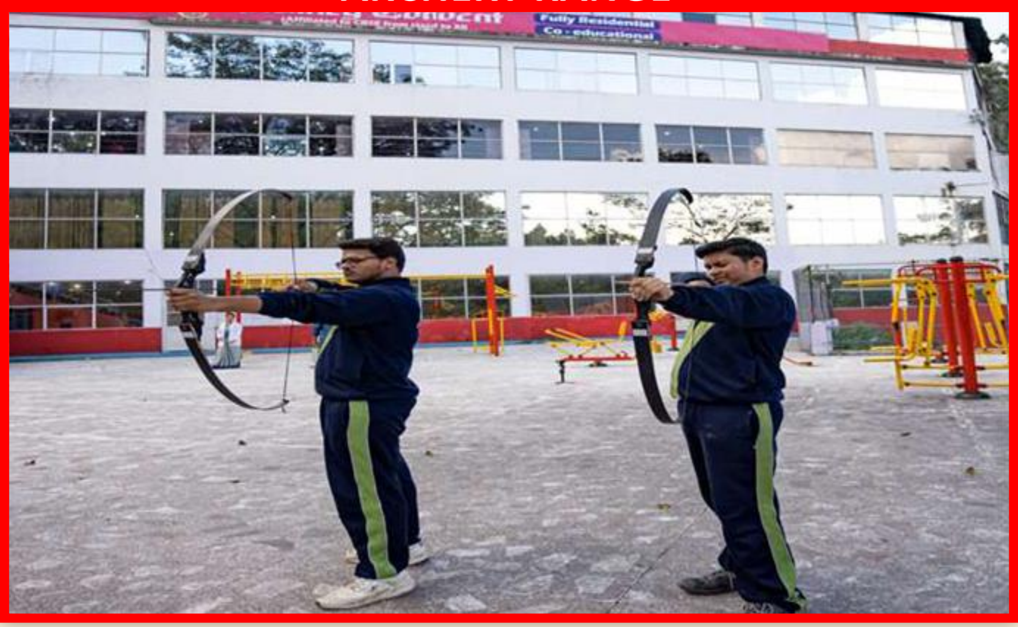
"Education is not the filling of a pail but the lighting of a fire."