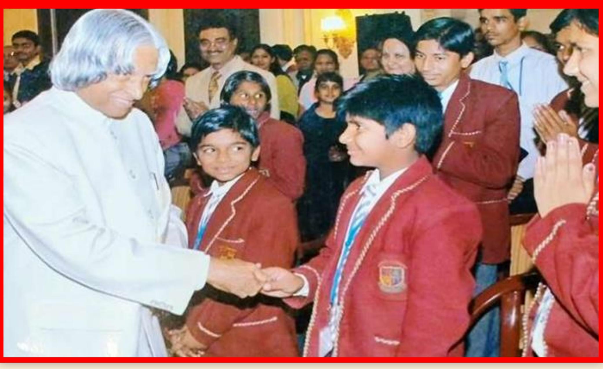
"Education is one thing no one can take away from you."