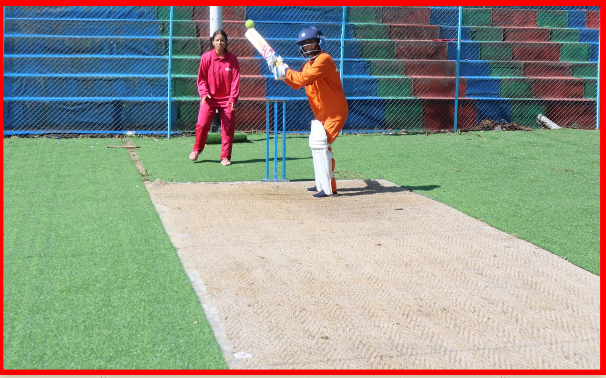
"An investment in knowledge pays the best interest."