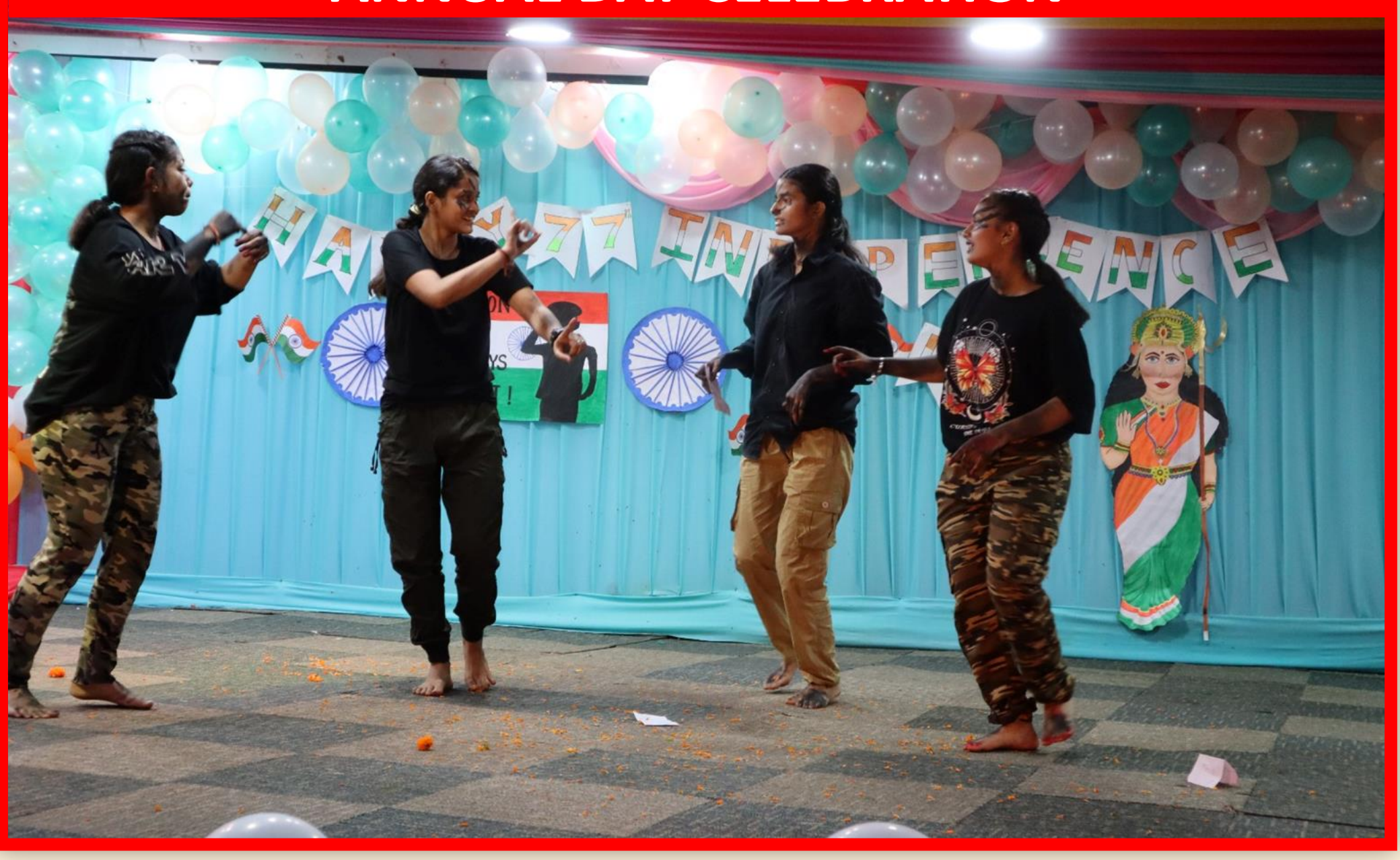
"I choose to make the rest of my life the best of my life."