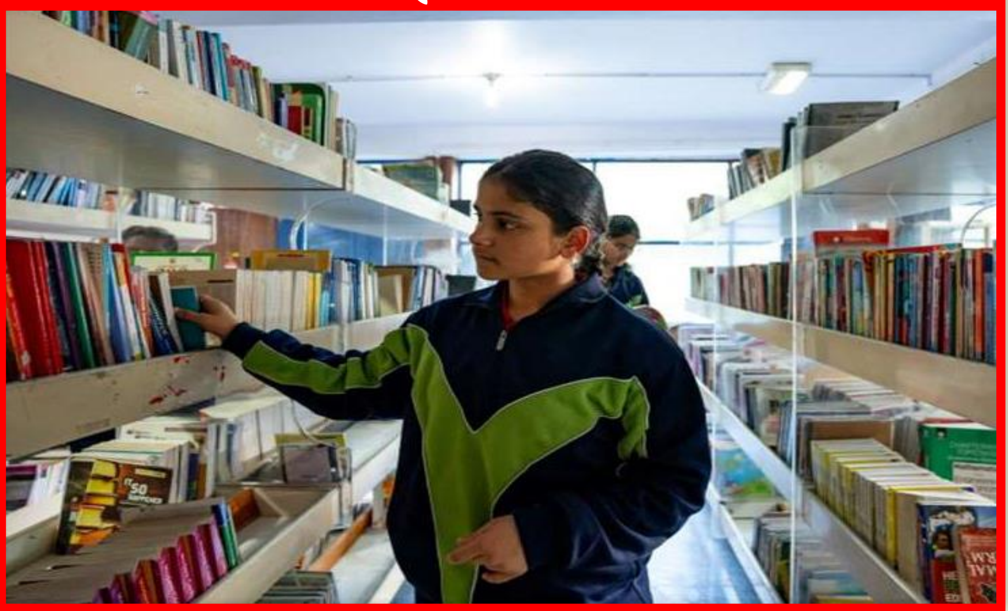
"I choose to make the rest of my life the best of my life."