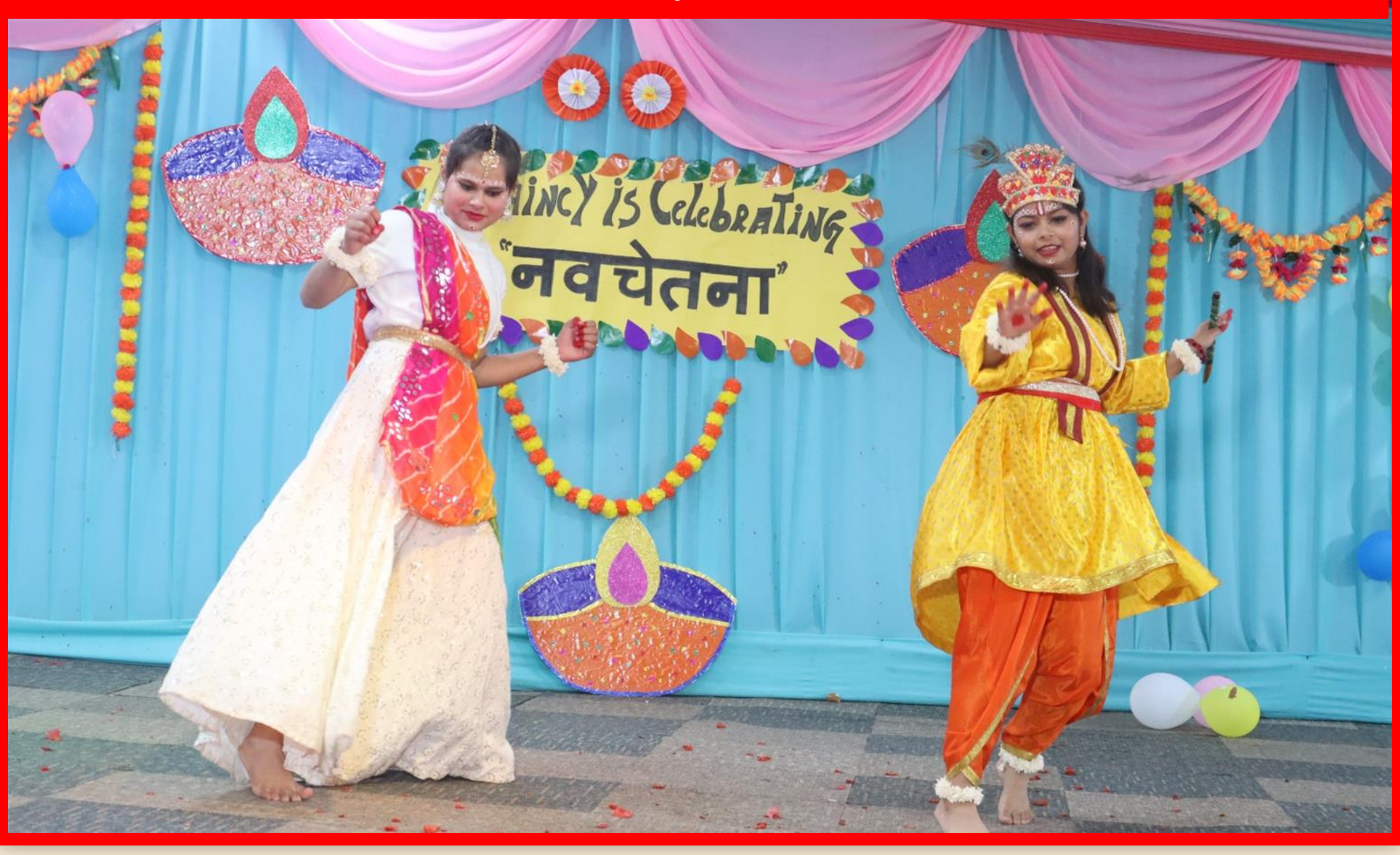
"There are two things to Aim at to get what you want and enjoy it."