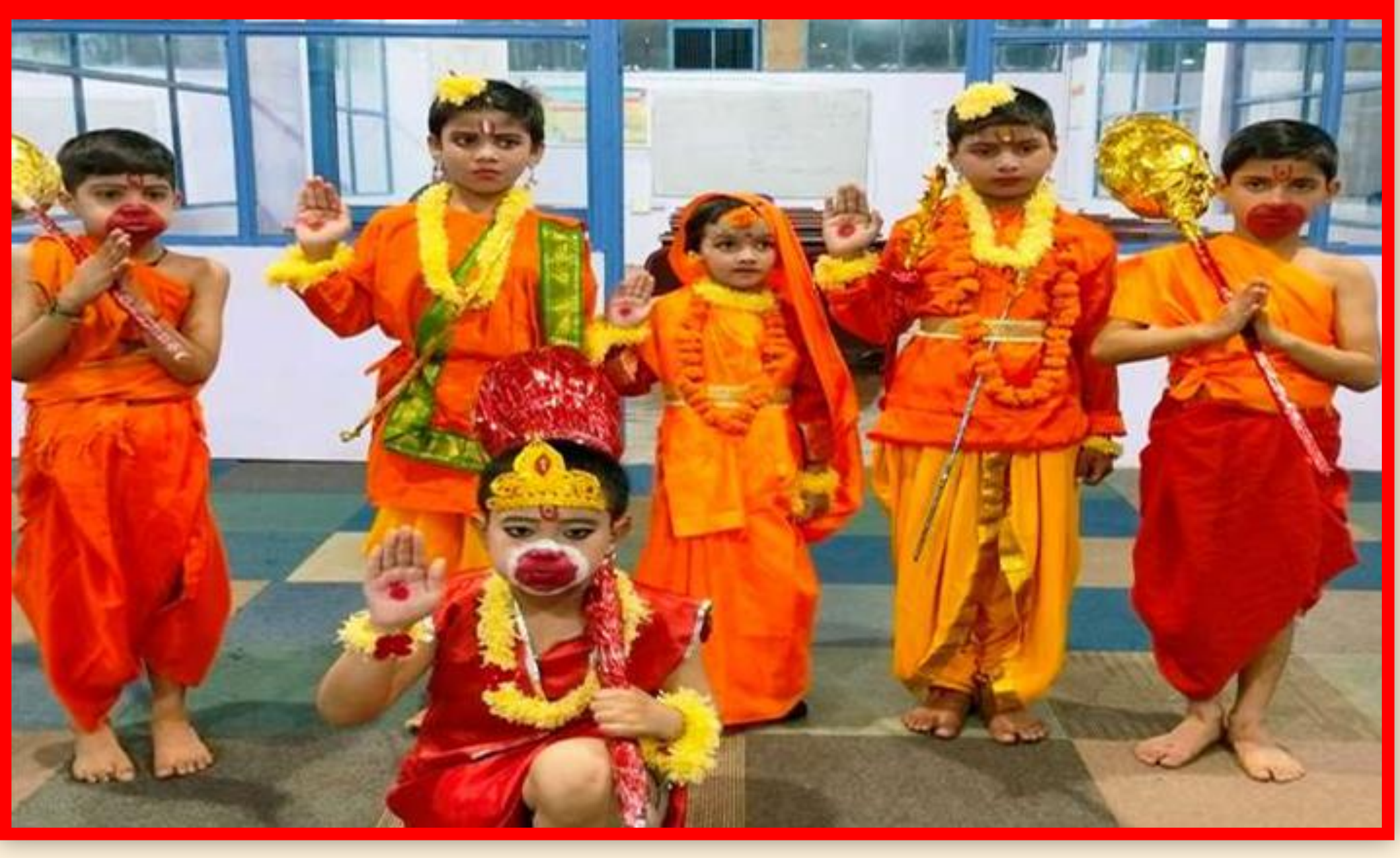
"The roots of education are bitter, but the fruit is sweet."