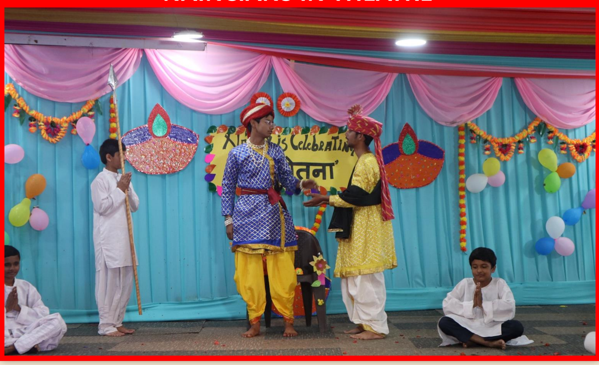
"I will not let anyone scare me out of my full potential."