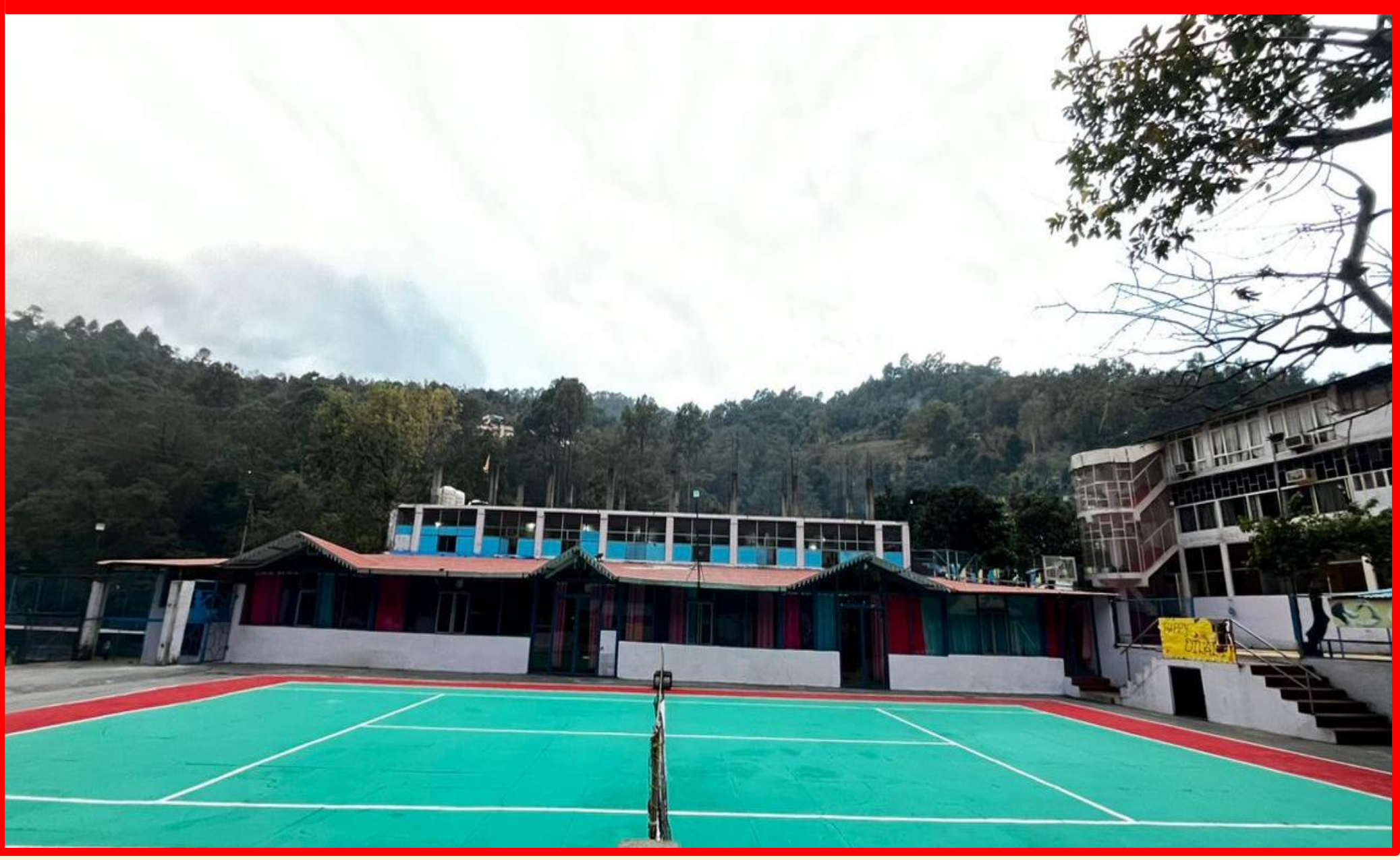
"The key to success is to start before you are ready."