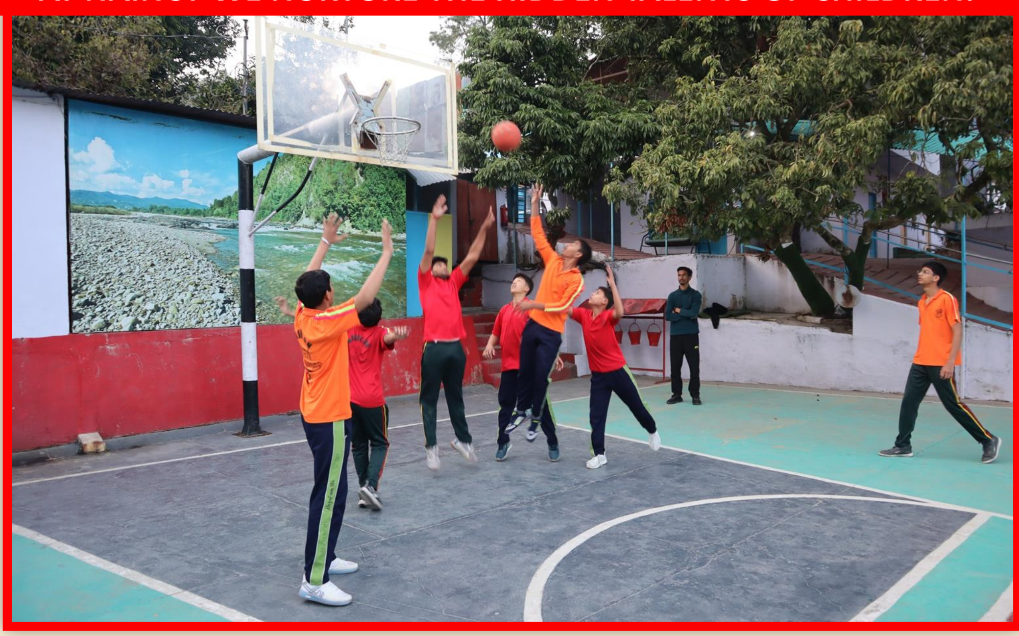
"One thing's for sure, if you don't play, you don't win."