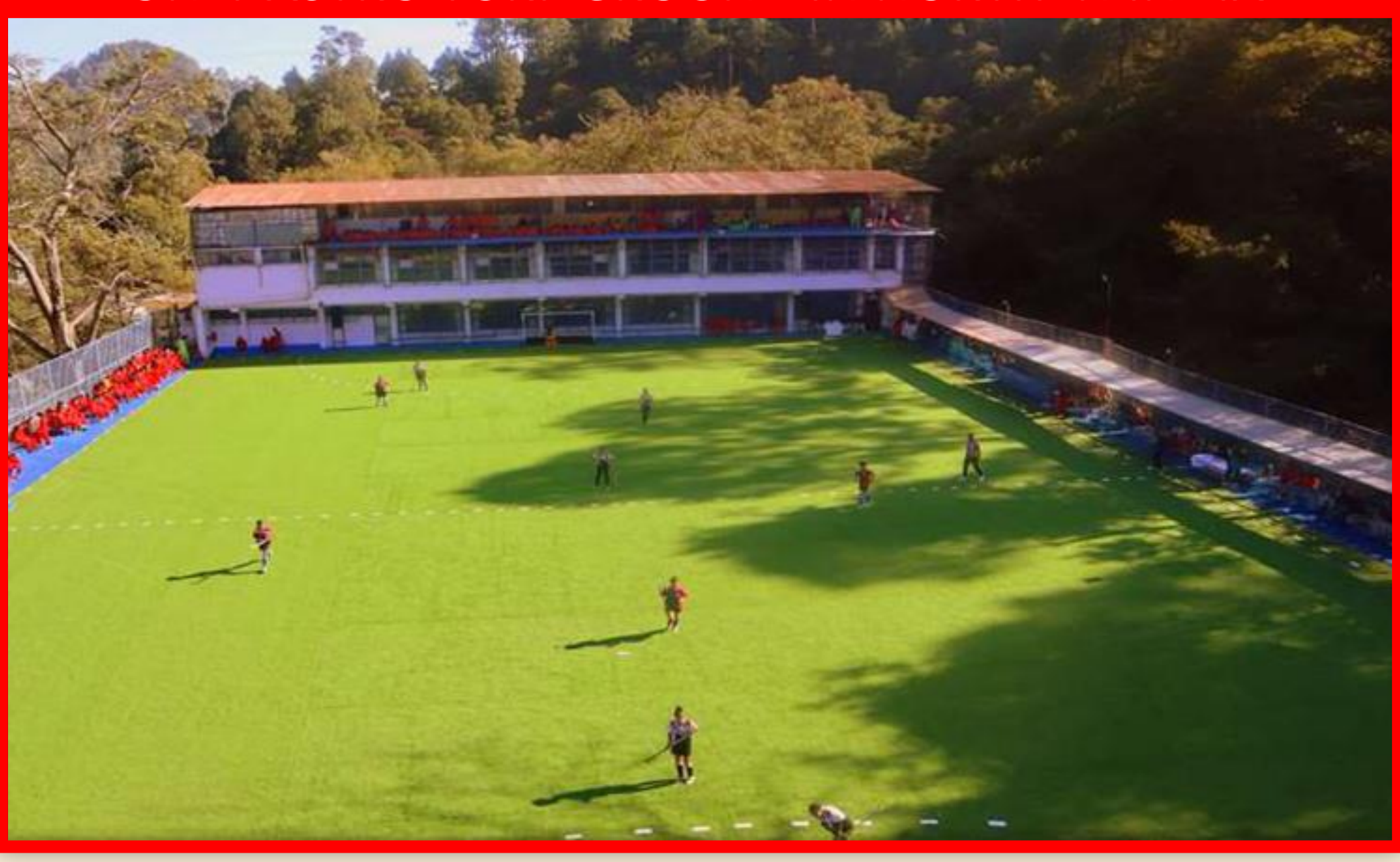
"Start where you are use what you have. Do what you can."