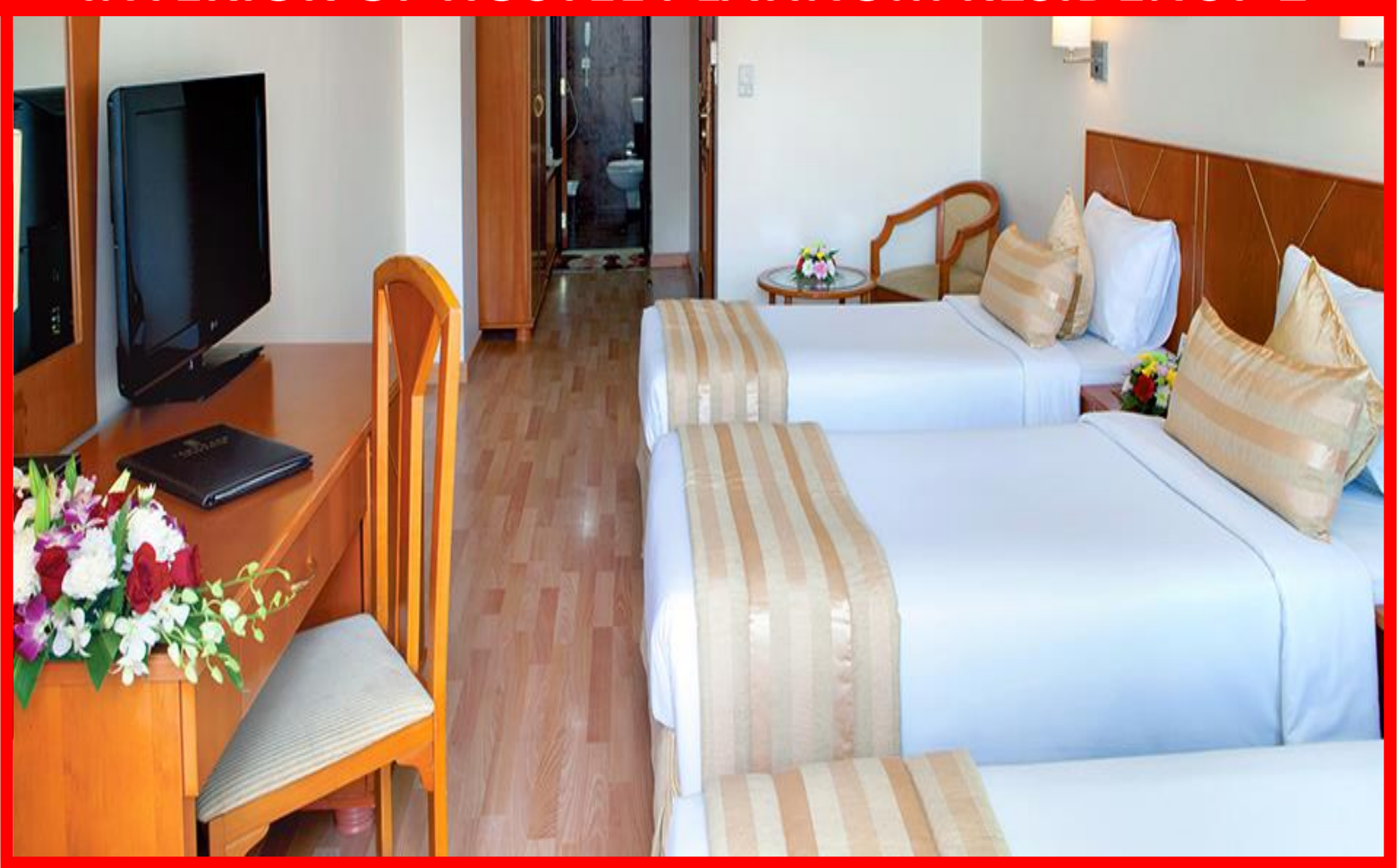
"The Best way to predict your Future is to create it."