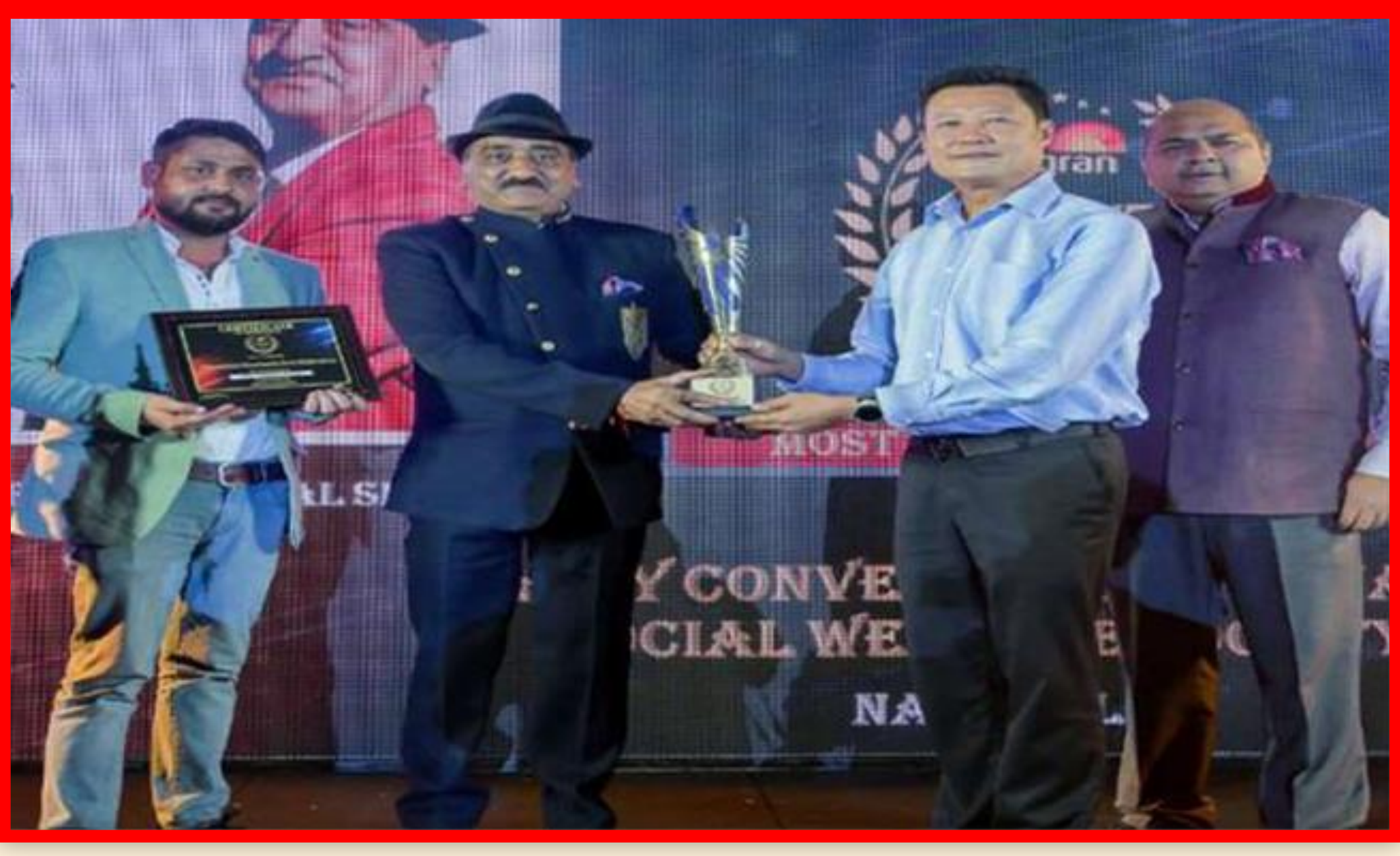
"Education's purpose is to replace an empty mind with an open one."