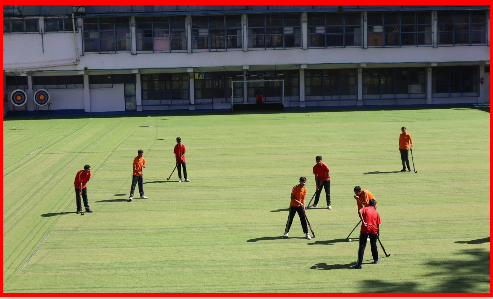
"Do not allow people to dim your shine, because they are blinded."