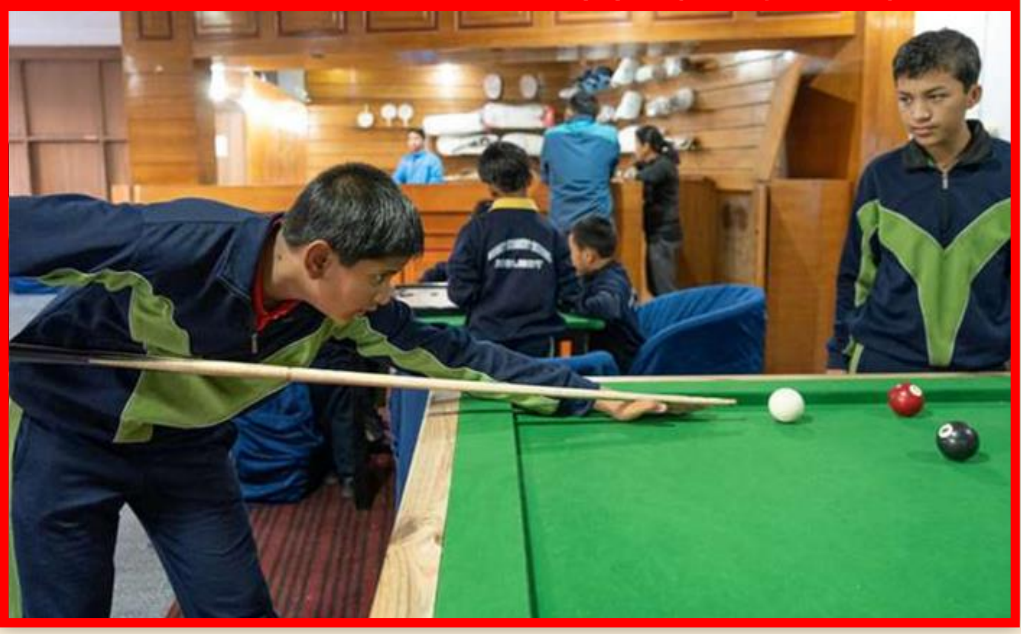
"Success usually comes to those who are too busy for it looking."