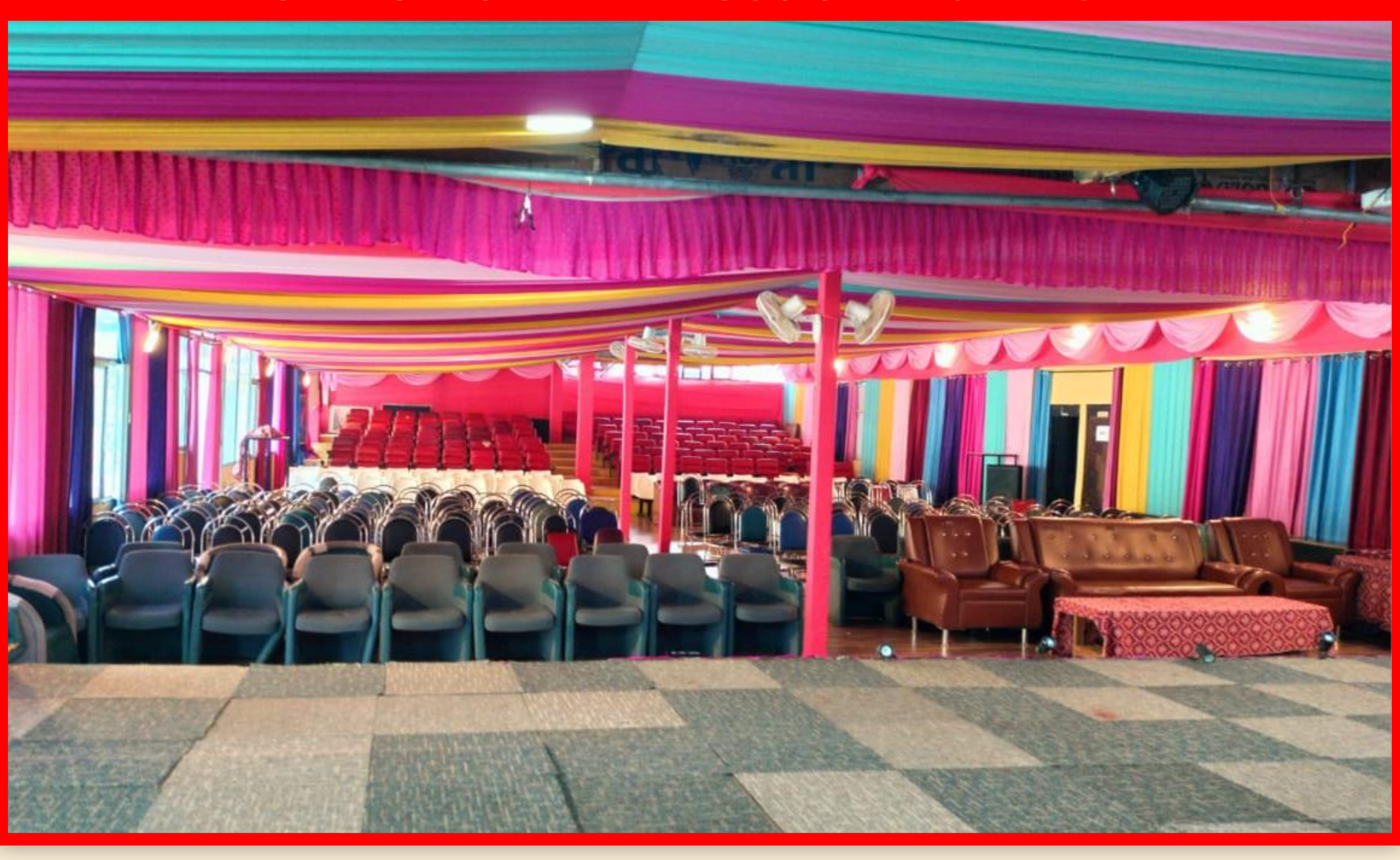
"Everyone you will ever meet knows something you don't."