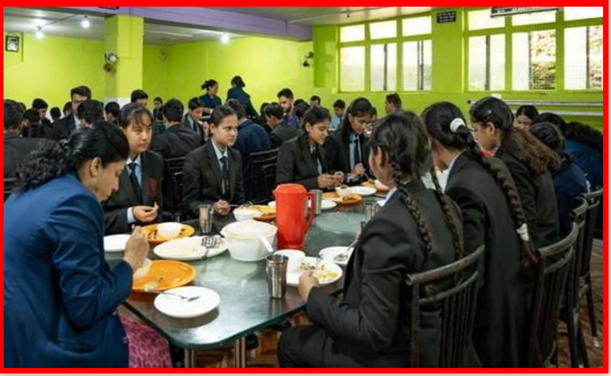
"The best way to predict your future is to create it."