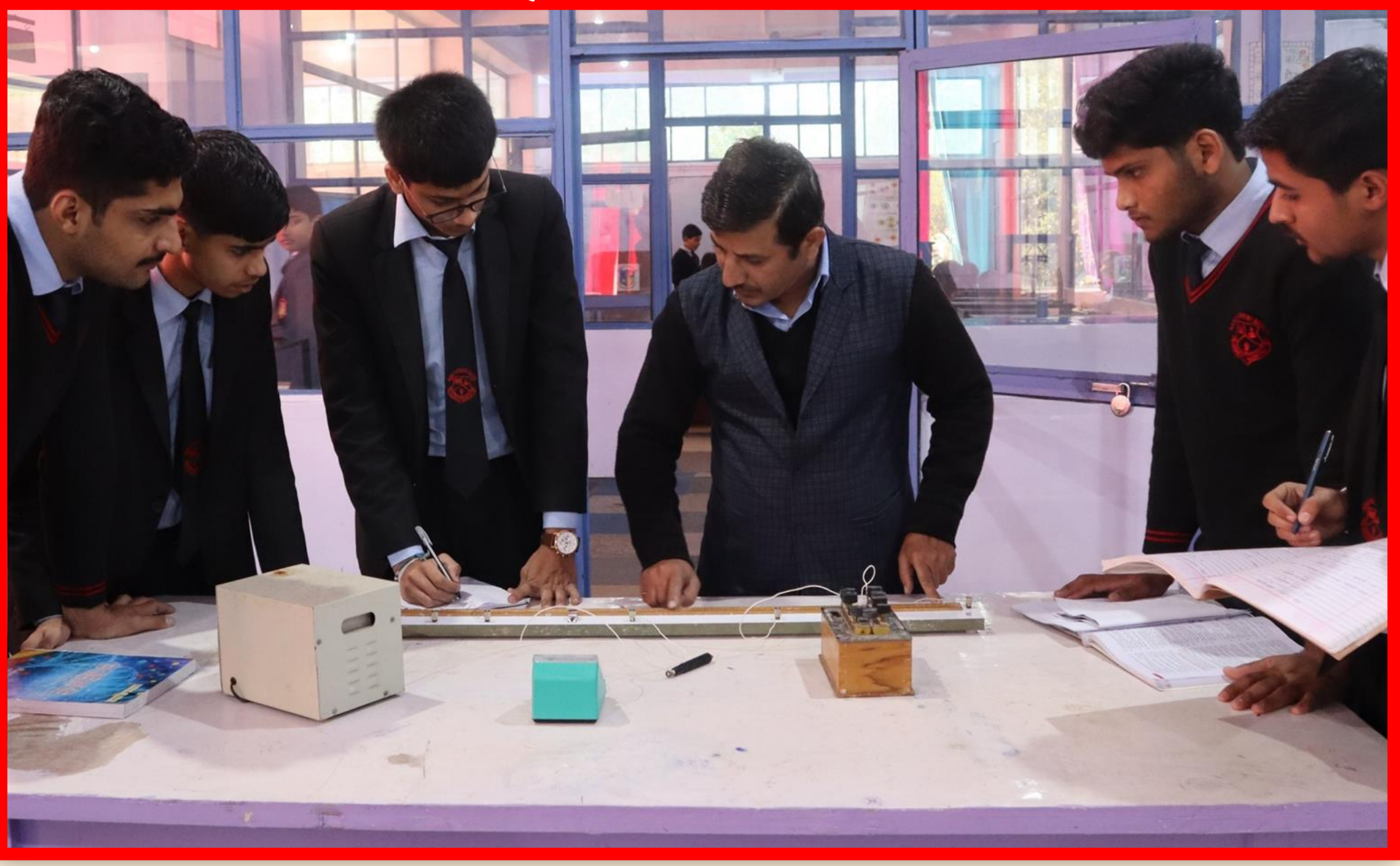
"You must do the kind of things you think you cannot do."