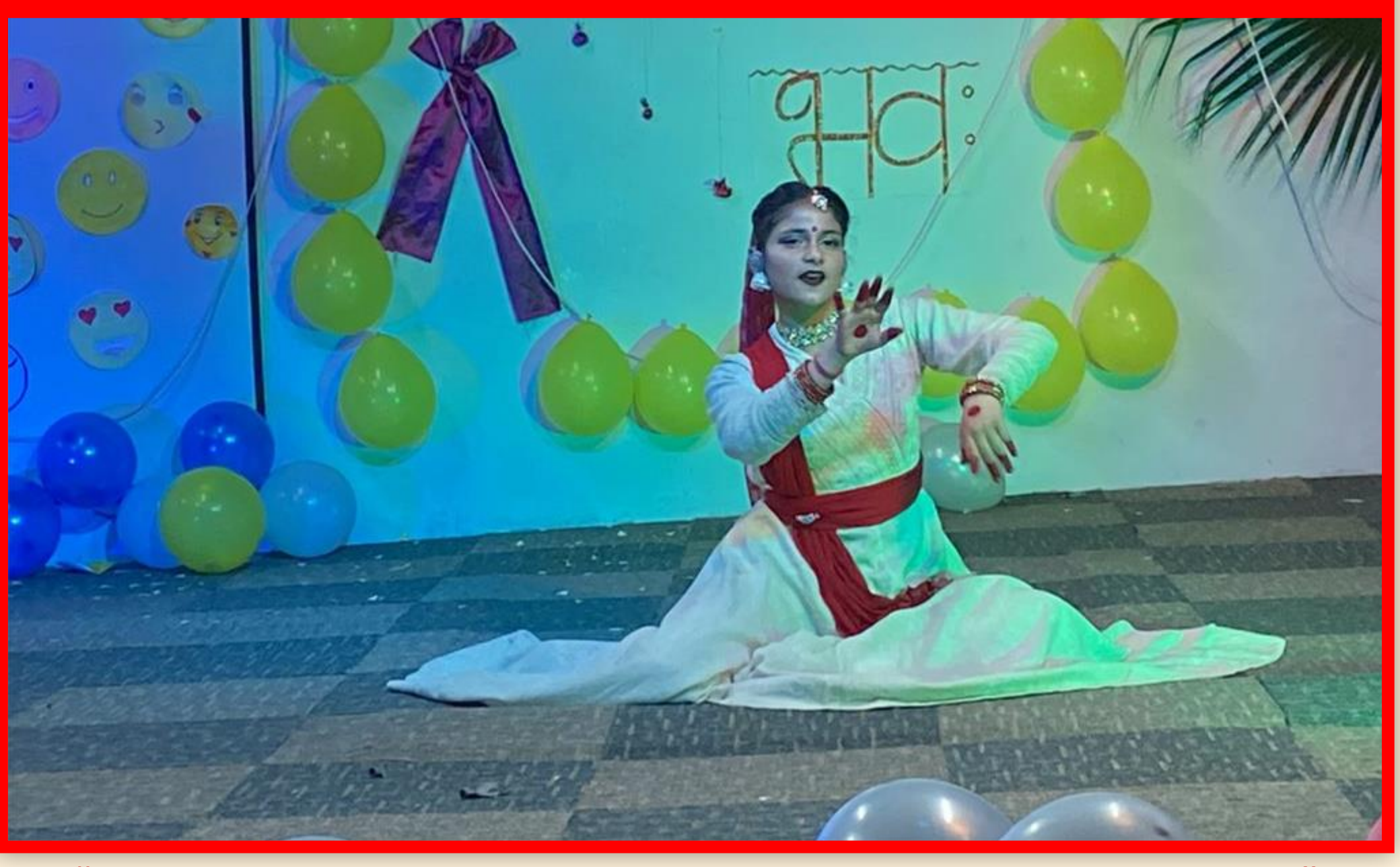
"HERE AT NAINCY WE WORK FOR HOLISTIC DEVELOPMENT OF CHILD."