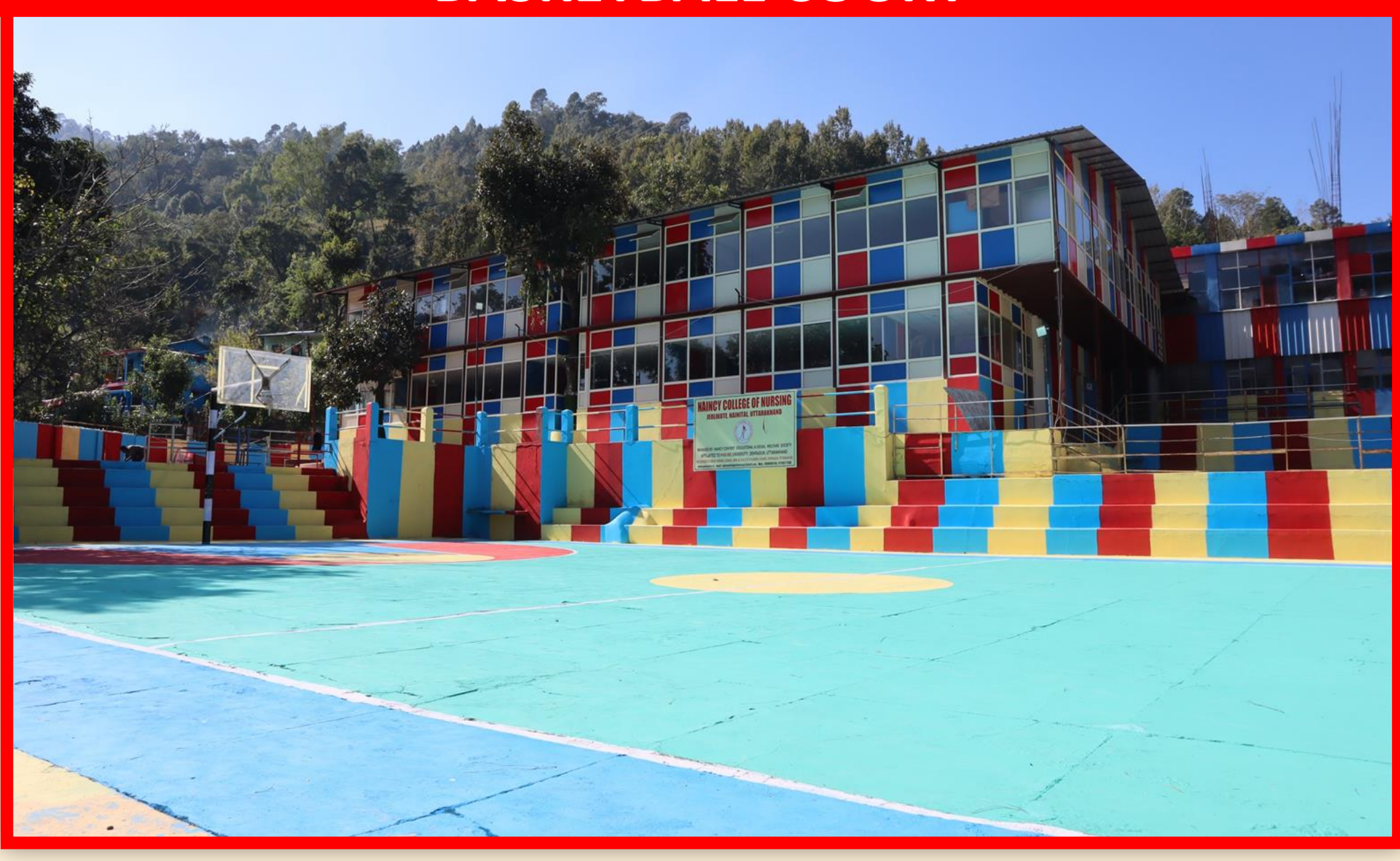
"All real education is the architecture of the soul."